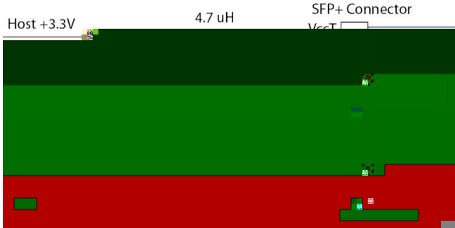
Figure3. Host Board Power Supply Filters Circuit